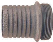
1" - 2-1/2" male