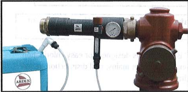
ARDEN's 2 1/2" size "Bazooka" feeding Calcium Thiosulfate liquid dechlorination solution.

The ARDEN Liquid "Bazooka" was designed for easy dechlorination of water mains, well disinfection, reservoir and hydrant flushing feeding Calcium Thiosulfate Solution. This unit is recommended when used to dechlorinate any water with a chlorine residual of over 25 ppm.