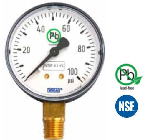
Bourdon Tube Pressure Gauge Type 111.10DW

Additional error when temperature changes from reference temperature of 68°F (20°C) \pm 0.4\% of span for every 18°F (10°K) rising or falling.