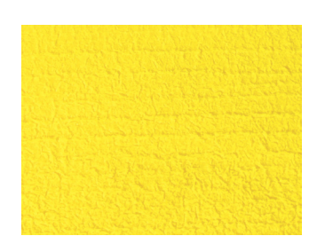
Textured Outsole: Provides grip on both wet and dry surfaces.