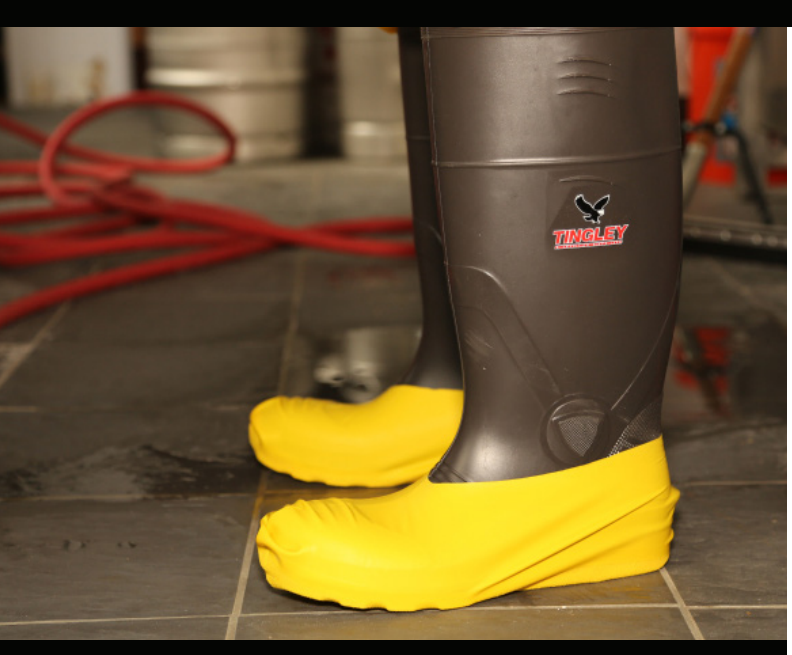
Boot Saver shoe covers are perfect for the color coded world of food processing by helping prevent cross-contamination.