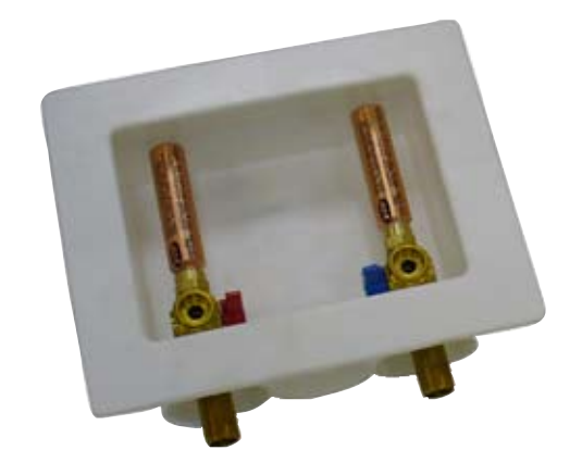
Plastic Laundry Box MM-500PLB

Precision Plumbing Products has designed a plastic/metal laundry box assembly that makes your installation simple and cost effective. Solenoid operated laundry equipment can create destructive water hammer due to quick closing valves on the fill cycle. Water hammer can damage or even break your hose connections as well as destroy the solenoid valve. To avoid this common household problem hook your washing machine hose connectors to the quarter turn ball valve in our laundry box assembly with water hammer arrestors and rest easy.