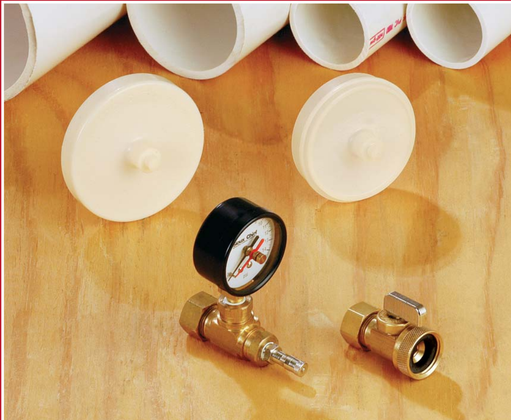
Use in drains