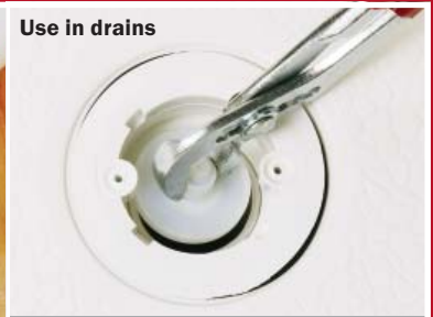
Air and water testing