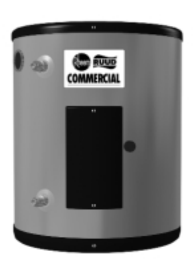
120, 208, 240, 277 and 480 voltages