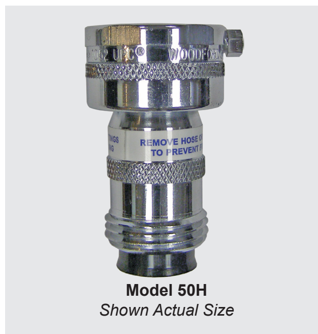
Model 50H Shown Actual Size