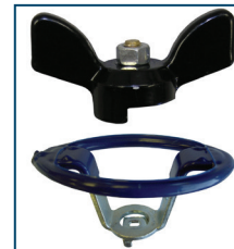
Tee or Oval Handle