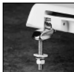
300 SERIES STAINLESS STEEL SELF-SUSTAINING HINGE