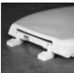
"LOCKED-IN" TOP-TITE® HINGE