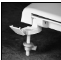
TOP-TITE® HINGES FEATURE NO-SLIP WASHER

Ring thickness is 3/4" Ring thickness including the bumper is 1-1/16" Height of the seat with cover is 2-1/4"