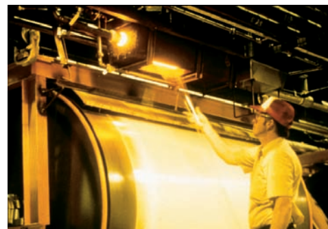
Continuous filament glass fibers are drawn from a furnace onto a revolving drum to form a dense, interlaced mat.

The chipboard filter frame, free of sharp edges, makes the panel easy to install and remove. After removal, the filter can be safely folded for compact disposal.