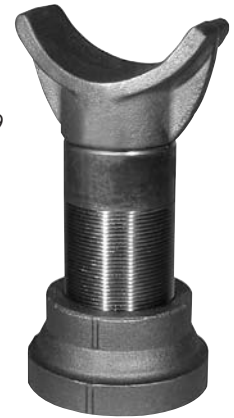
FIG. 264: LOADS (LBS) • WEIGHT (LBS) • DIMENSIONS (IN)