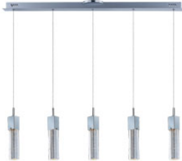
E22764-89PC Fizz III 5-Light LED Pendant