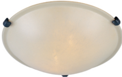
2681WSOI Malaga 3-Light Flush Mount