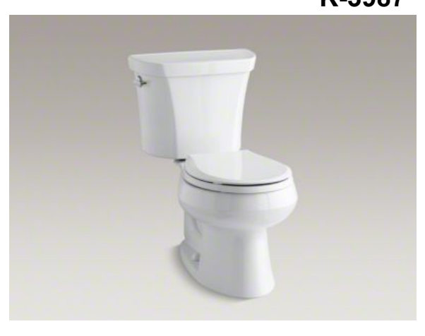
For complete listing of available colors, go to kohler.com.