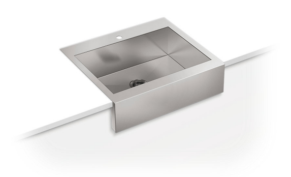
Codes/Standards ASME A112.19.3/CSA B45.4

1130570 Hardware Kit, Self-Rimming 1173293 Hardware Kit, Side Clip