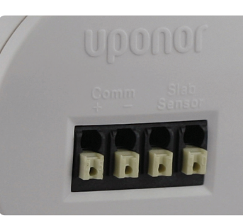
Figure 2: Wall Sensor Terminal