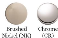
Brushed Nickel (NK)

LKGT1054 - Elkay Soap / Lotion Dispenser