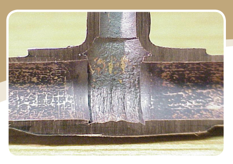
Copper tubing brazed without nitrogen purge. *Notice the black oxide deposits.