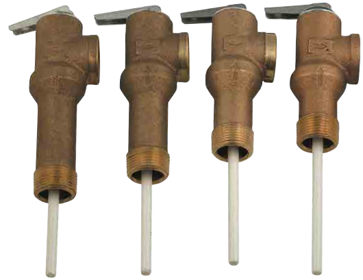
LFLLL100XL LFL100XL LFLL100XL LFSL100XL