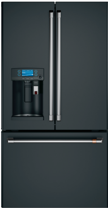
Matte Black with Brushed Stainless handles