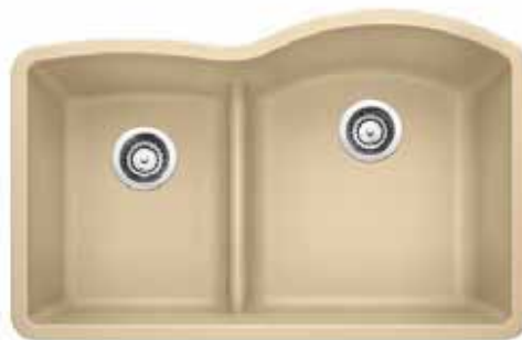
Model 441607 shown

While BLANCO endeavors to provide accurate information, all dimensions are nominal, cannot be guaranteed, and are subject to change or cancellation. BLANCO assumes no responsibility for use of superseded or voided specifications.