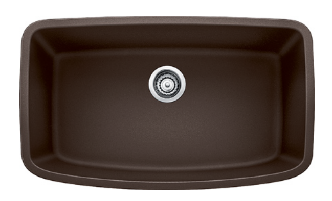
Model 441613 shown