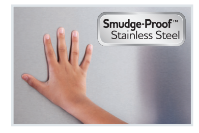
Smudge-Proof™ Stainless Steel Resists fingerprints and cleans easily.

Fresh air offers great taste. PureAir® Filtration removes up to 7 times more odor than baking soda to keep ingredients tasting fresh by removing odor particles with fast-acting, highly absorbent carbon technology!