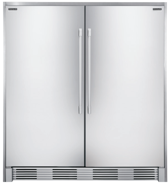
Shown with companion, All-Freezer model FPFU19F8RF and optional coordinated Dual 75" Collar Trim Kit (TRIMKITEZ2).