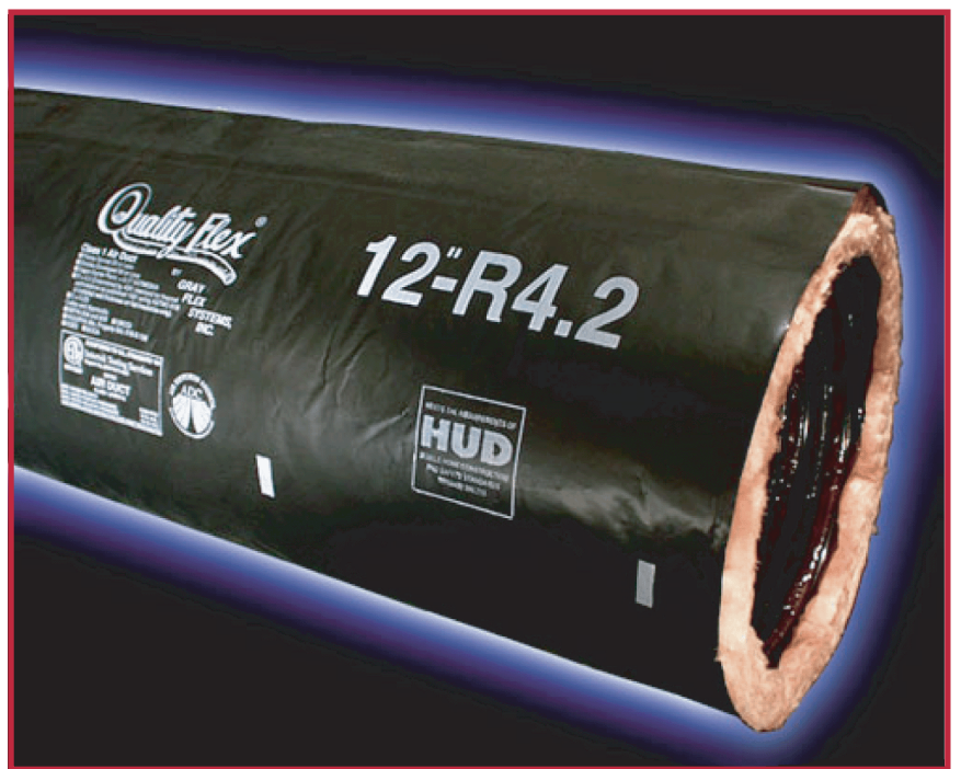
MOBILE HOME DUCT