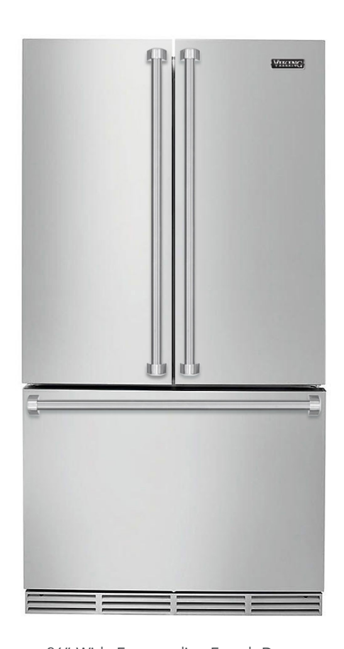
36" Wide Freestanding French-Door Bottom-Freezer