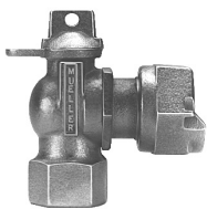
Lockwing MUELLER 300 Ball Angle Meter Valve