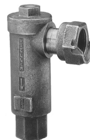
Top entry dual check valve (dual angle check also available; not shown)