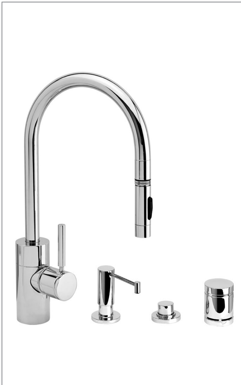
Finish Shown - Chrome