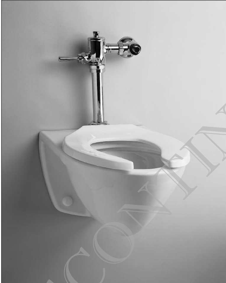
CT708 - Wall Hung Flushometer Toilet SC534 - Commercial Toilet Seat