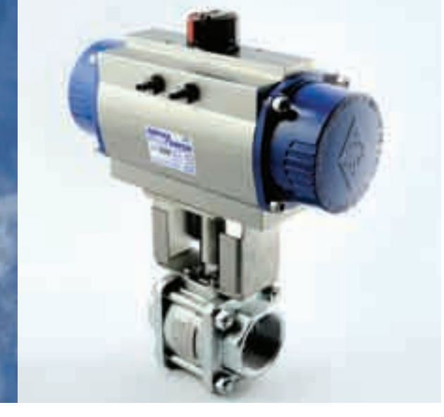
Not all associates can offer all services/solutions detailed in this sales brochure

Bahrain Iran Jordan Kuwait Lebanon Oman Qatar Saudi Arabia Syria