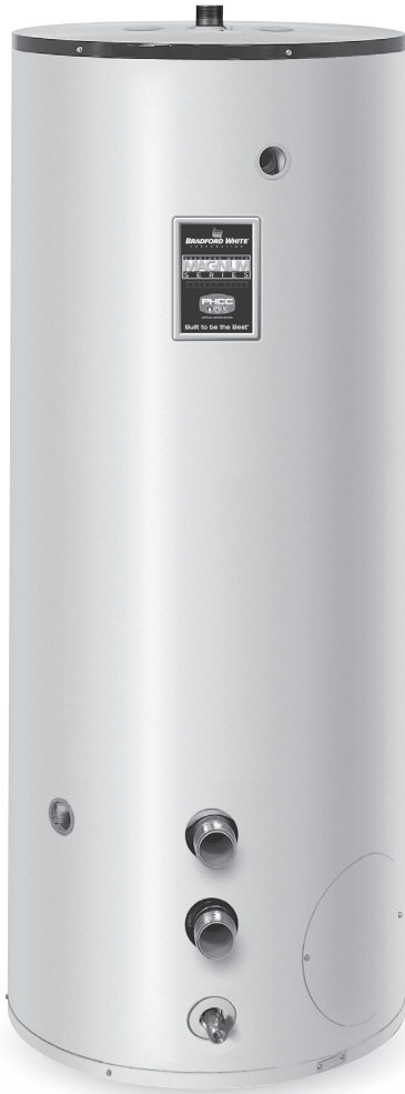
Photo is of M-3-ST80R5