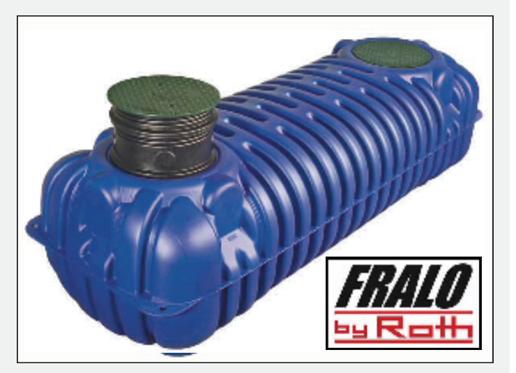
FRALO brand septic tank by ROTH Global Plastics, Inc.