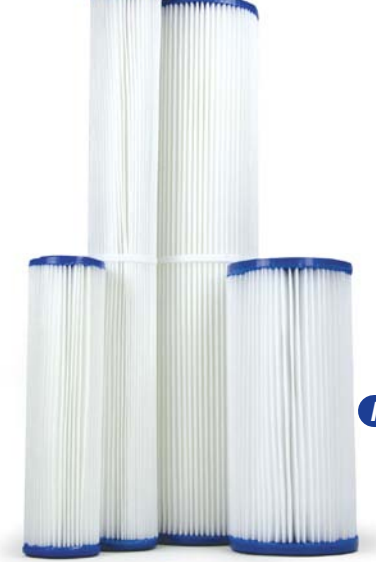
PLEATED CARTRIDGE FAMILY