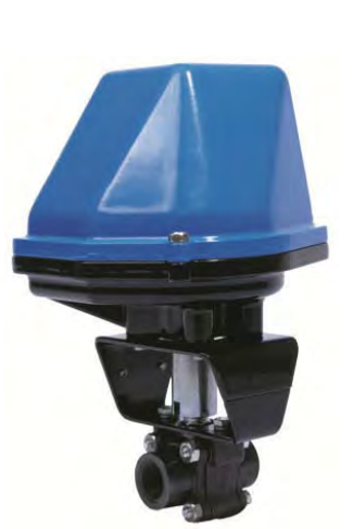
Motorized Ball Valve