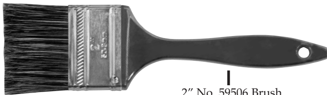
2" No. 59506 Brush

Examples include use as a chip or parts cleaning brush, as fiberglass, epoxy, glue or lubricant applicators and as dry or feathering brushes in Faux or other technique finishing. The perfect no-clean disposable brush.