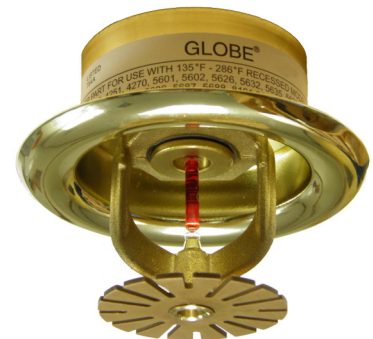
SERIES GL-QR/ECLH EXTENDED COVERAGE LIGHT HAZARD RECESSED PENDENT GL1112