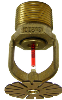
SERIES GL-QR/ECLH EXTENDED COVERAGE LIGHT HAZARD PENDENT GL1112