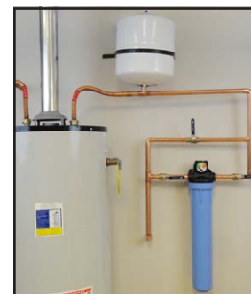
Pictured: EWS-HEATER-GUARD-3/4 installed with bypass at the inlet to a typical water heater