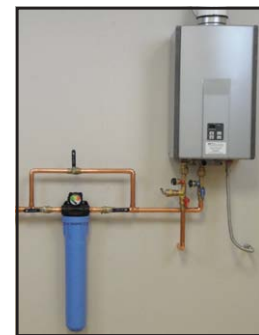
Pictured: EWS-HEATER-GUARD-3/4 installed with bypass at the inlet to a typical tankless water heater