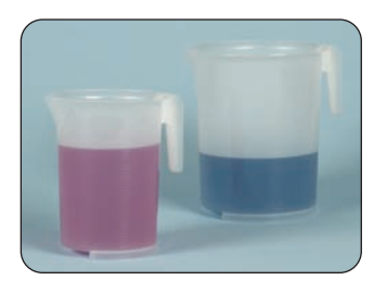
5 and 10 Liter Capacity