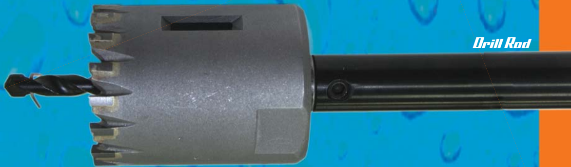
Pilot Bit Kit