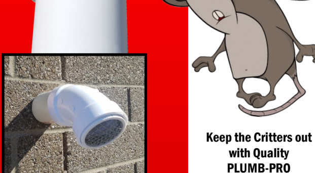
Patented Condensate Channel on 2 Inch and Above Prevents Freeze Build-up