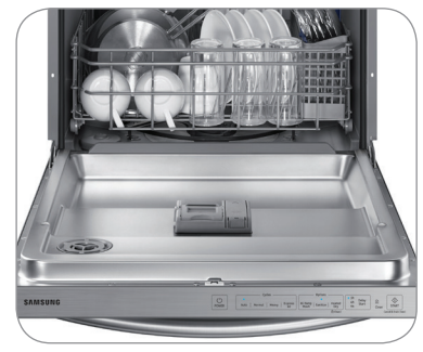
Stainless Steel Interior Door