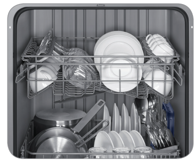
Height-Adjustable Upper Rack