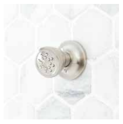
REVISED 01/10/2020 Code: SHBS5010EBN/SHBS5010ECP SHBS5010EORB/SHBS5010EPN

All \ dimensions \ and \ specifications \ are \ nominal \ and \ may \ vary. \ Use \ actual \ products \ for \ accuracy \ in \ critical \ situations.