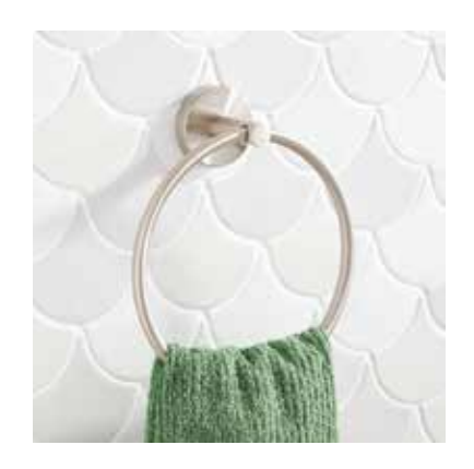
REVISED 01/14/2020 CODE: SHMLEDTRBN/SHMLEDTRCP

All \ dimensions \ and \ specifications \ are \ nominal \ and \ may \ vary. \ Use \ actual \ products \ for \ accuracy \ in \ critical \ situations.