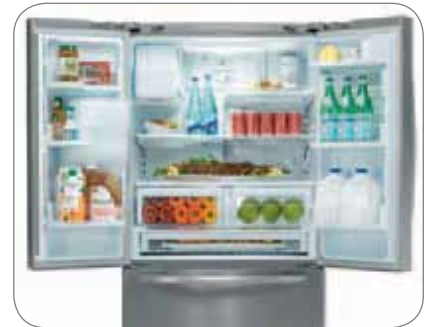
Largest Counter Depth Storage Capacity