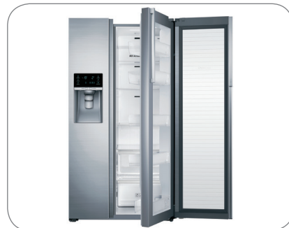
Food ShowCase Fridge Door