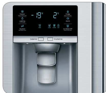
External Filtered Water and Ice Dispenser