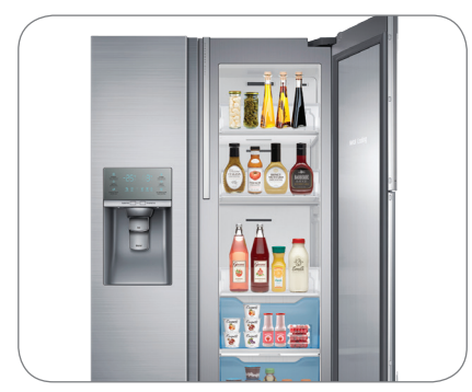
Food ShowCase Fridge Door