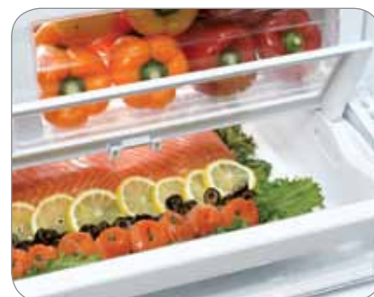
CoolSelect Pantry™ with Temperature Control