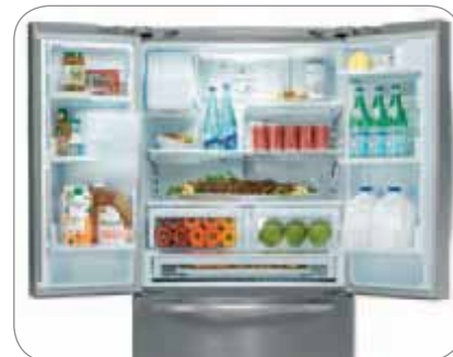
French Door Design