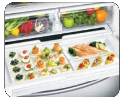
Automatic Filtered Ice Maker in Freezer (External Filter Not Included)