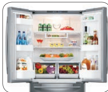
French Door Design