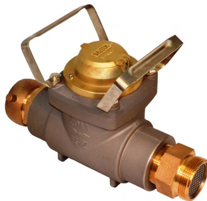
FHZ25S**-CV Configured with NC2525B-CV Check Valve Assembly