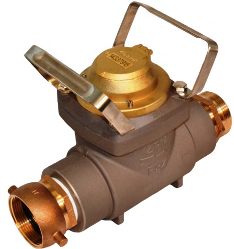
FHZ25S** Stainless Steel Double Strap Handle

OPTIONS: Gate Valves, check valves, reduced pressure backflow preventers, locking devices, special order connections, stainless steel double handles, pistol grip handles, "add-on" restrictor plates and stands.