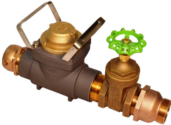
FHZ30S**-GVCV Configured with 3" Gate Valve and NC2530B-CV Check Valve Assembly