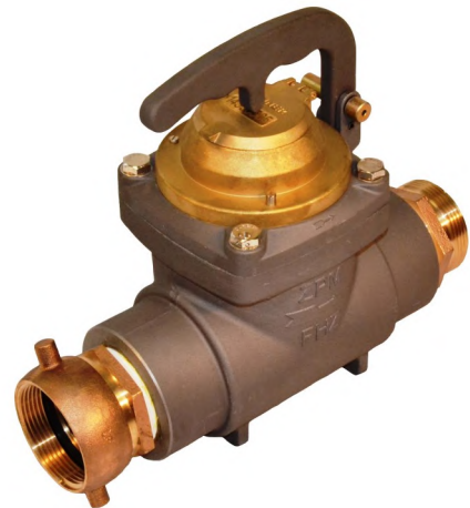
FHZ25B** Barrel Lock Single Handle