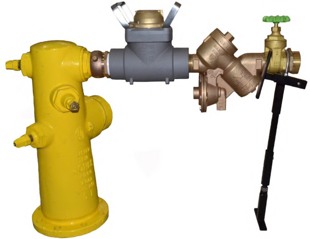
FHZ20S**-W975 Configured with Dual Check RPZ Backflow Preventer and Stand