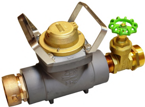
FHZ20S**-GV Configured with 2" Gate Valve