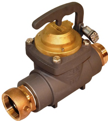
FHZ25P** Padlock Single Handle