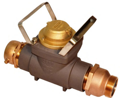
FHZ30S**-CV Configured with NC2530B-CV Check Valve Assembly