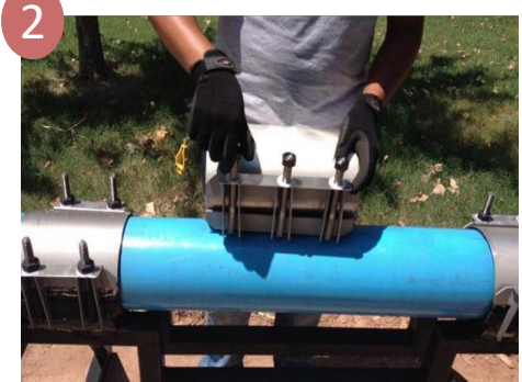
Loosen nuts to the end of the stud, place the clamp around the pipe centered over the break or damage area with the gasket flap at the top.