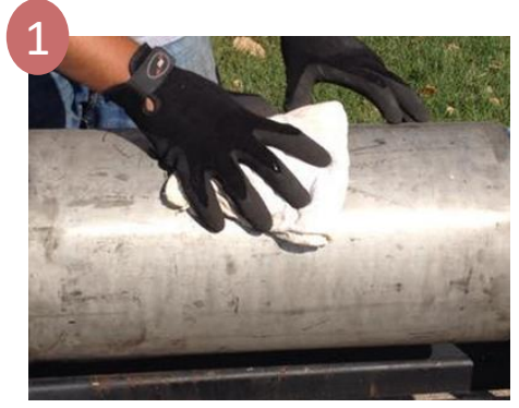
Thoroughly clean the pipe where the clamp will be installed.

should be formed over the missing area to provide