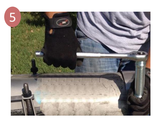
Evenly tighten the studs working from the center outward. Maintain an even gap between fingers studs when installing multi-panel repair clamps.